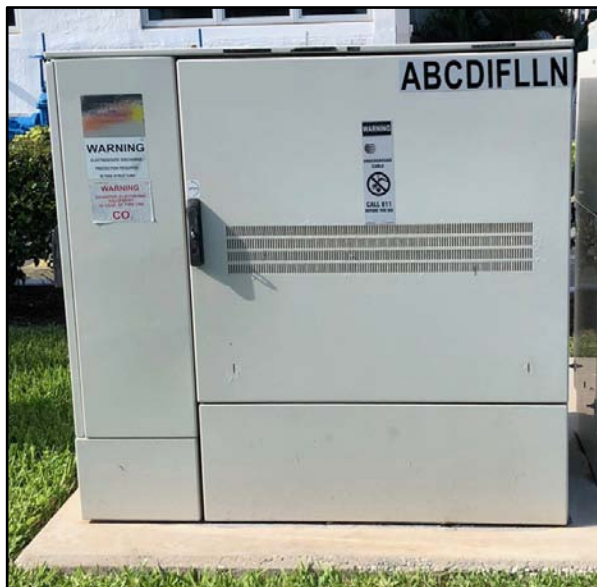
VRAD / PURCELL ALP-248/448 CABINET (OUTSIDE VIEW)