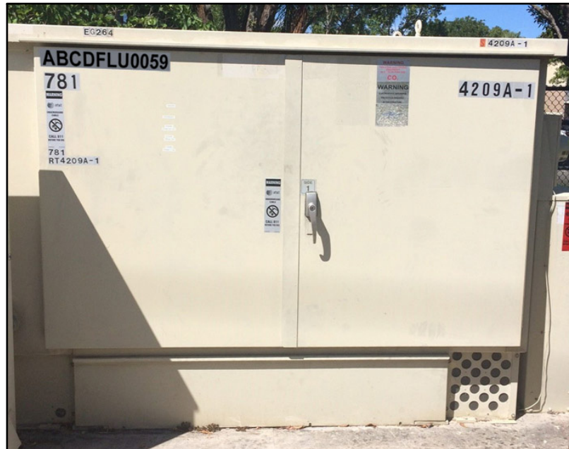
LSC-2020 CABINET (OUTSIDE VIEW)