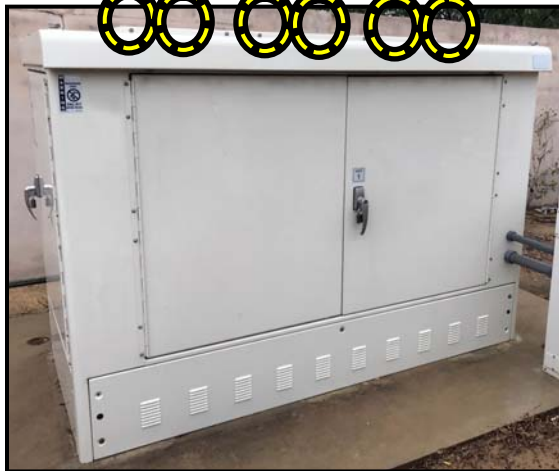
LS2016 CABINET (OUTSIDE VIEW)

(2) "PDFA" TRAYS ARE SHOWN IN THIS CABINET (6 FANS)