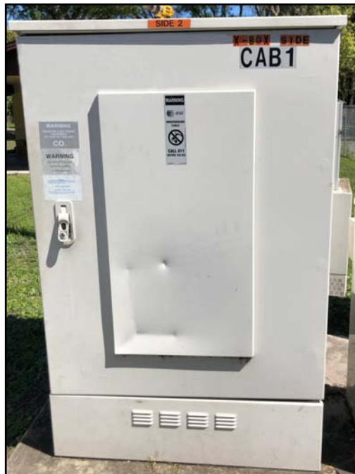
MESA 384 CABINET (OUTSIDE - FRONT VIEW)