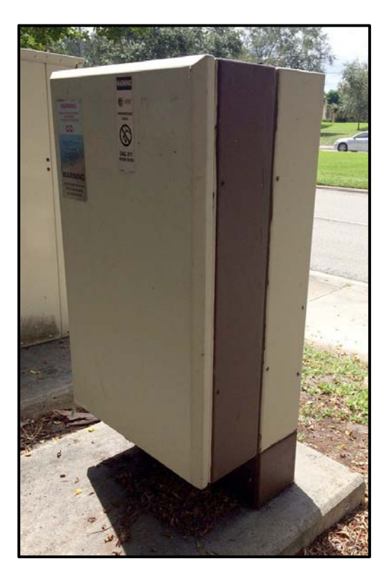
36B CABINET (OUTSIDE VIEW)

(1) FAN TRAY UNIT IN EACH CABINET (3 FANS)