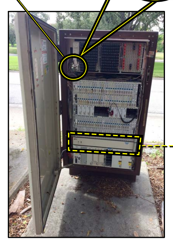
INSIDE VIEW OF CABINET