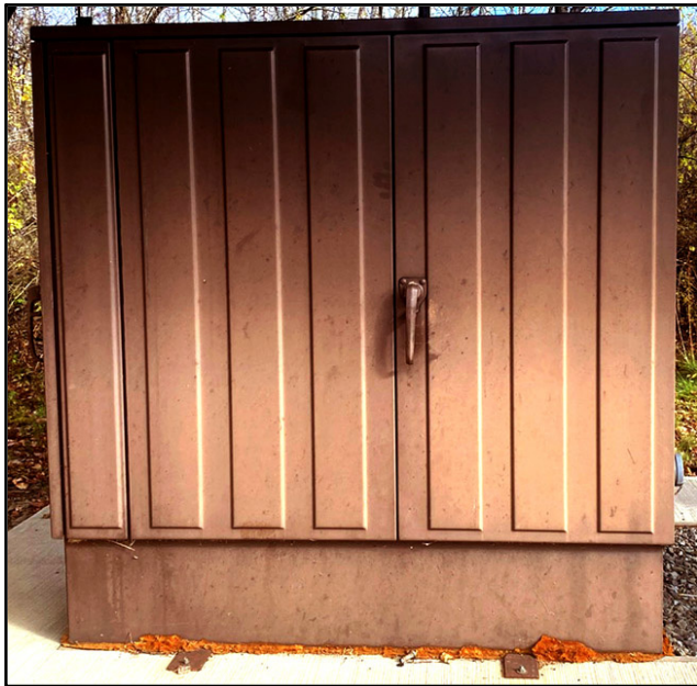
NORTEL DMS OPM CABINET (OUTSIDE VIEW)

(TAG Refurbished UPGRADE ) (see following page for picture)