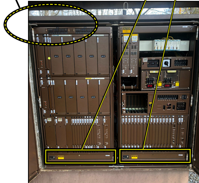
NORTEL DMS OPM CABINET (INSIDE VIEW)

150 Cooper Rd. (F-15) W. Berlin, NJ 08091