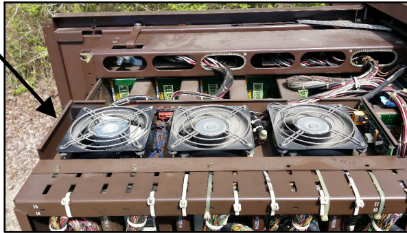
BOOSTER FAN UNIT (BFU)

TAG will UPGRADE your fan tray ELIMINATING THE NEED FOR PADDLES!