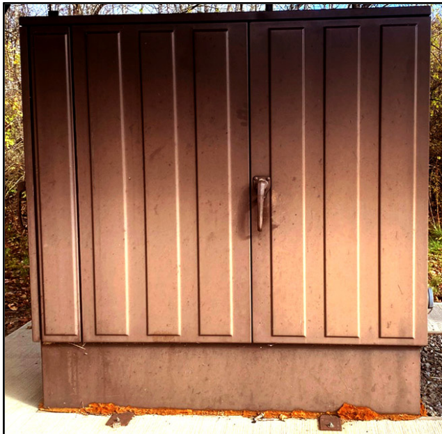
NORTEL DMS OPM CABINET (OUTSIDE VIEW)

(TAG Refurbished UPGRADE ) (see following page for picture)