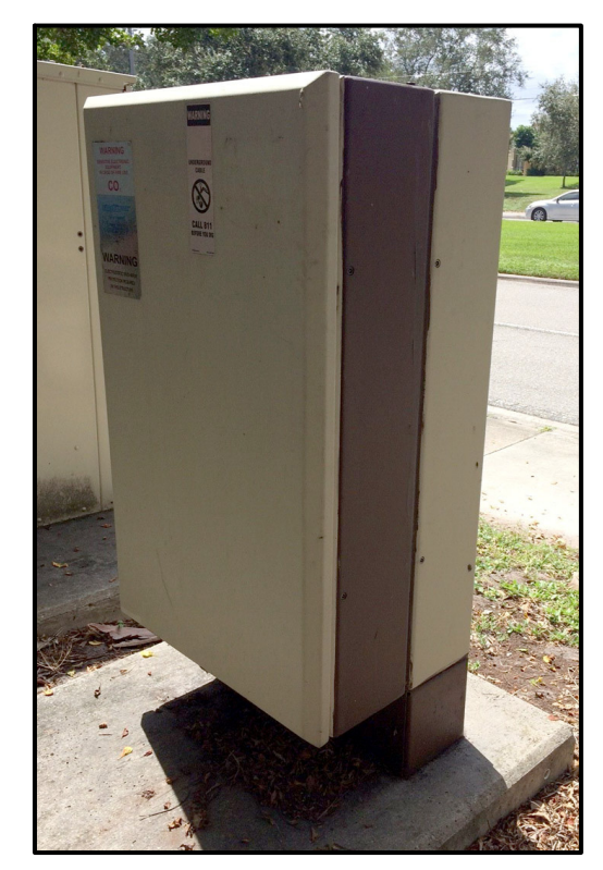
36B CABINET (OUTSIDE VIEW)