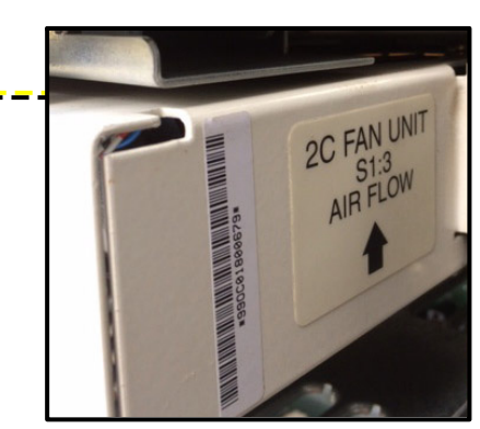
2C FAN TRAY UNIT (SIDE VIEW)

150 Cooper Rd. (F-15) W. Berlin, NJ 08091