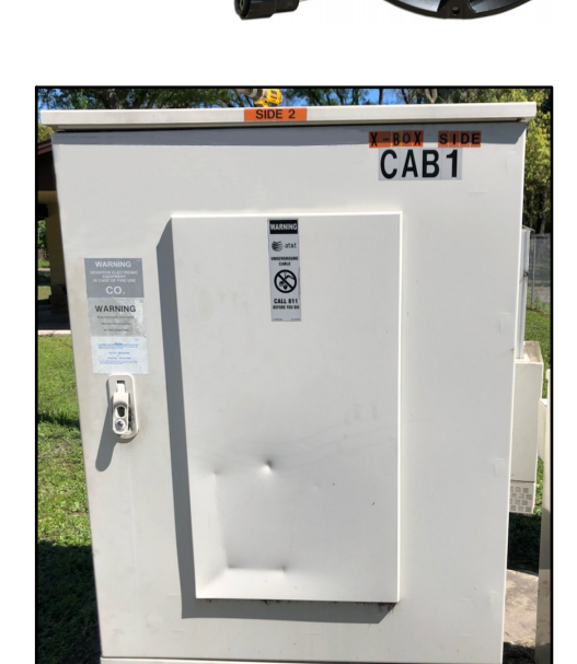
MESA 384 CABINET (OUTSIDE - FRONT VIEW)