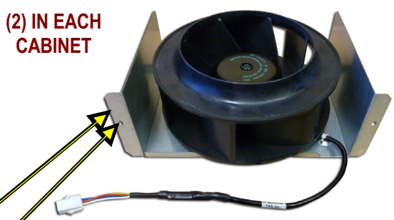
*(for Fan without Bracket, order # TF-MC225-02)

(NEW 225mm "Bottom" Heat Exchanger Kit*)