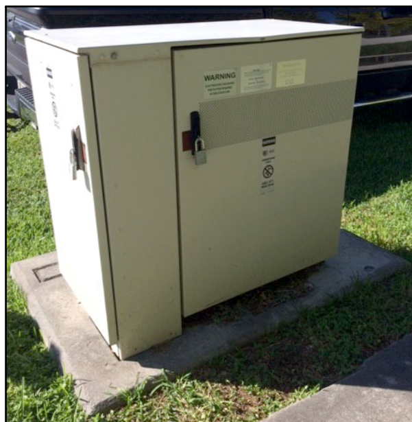
VRAD / COMMSCOPE ALP-448U CABINET (OUTSIDE VIEW)