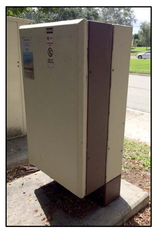
36B CABINET (OUTSIDE VIEW)

(1) FAN TRAY UNIT IN EACH CABINET (3 FANS)