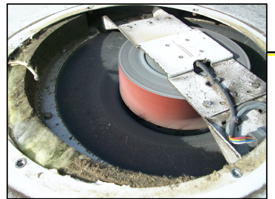
TAG # TFCS-MESA246-12