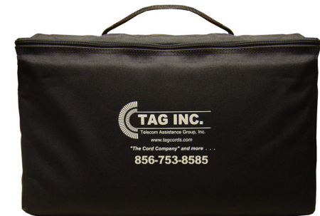
(1) 600FKCC Carrying Case

Each test cord is labeled with the part number & has red color bands at each end (See Fig. 1 above).