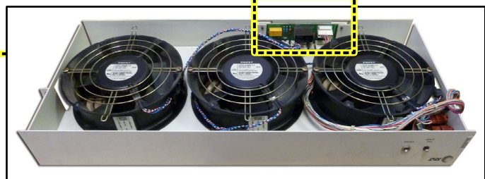
LUCENT 2B FAN TRAY w/ (3) EXISTING FANS (BOTTOM VIEW) (fan tray is not included)