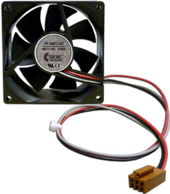
NEC FD-31201A / FD-32401A LINE TERMINATING MULTIPLEXER UNIT w/ DEFECTIVE FANS