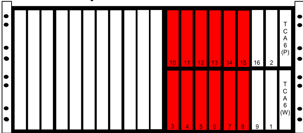
Fujitsu FLASHWAVE* 4300 Shelf