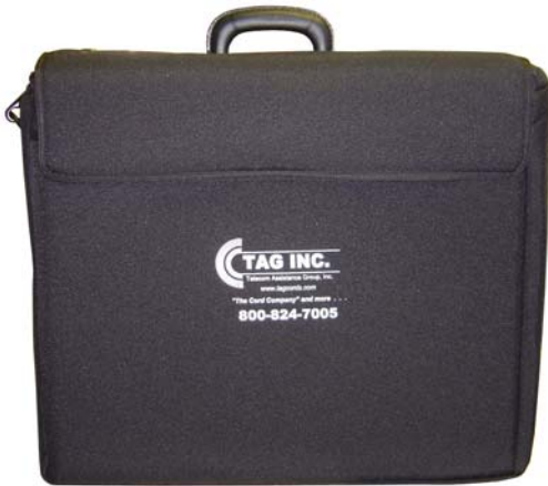
(1) 600209XL Carrying Case

At the DSX-1, inject a signal using TAG's DSX Test Sender / Short Test Unit (ST-DSX2). Watch the associated lights on the unit illuminate.