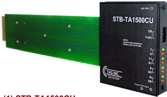
(1) STB-TA1500CU Adtran Total Access 1500 Channel Unit Streaker/Test Board (w/ LED's and Bantam Jacks)