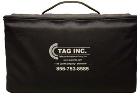
(1) 600209N Approx. Dimensions: Carrying Case 9" (H) x 16" (L)