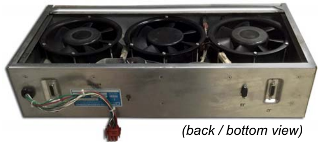
(back / bottom view)