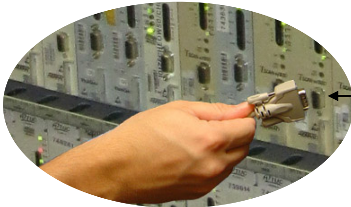
9 Pin connector on HDSL ckt