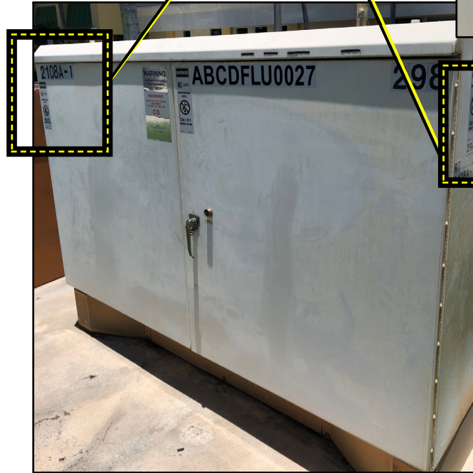
FUJITSU 6200 CABINET (OUTSIDE VIEW)