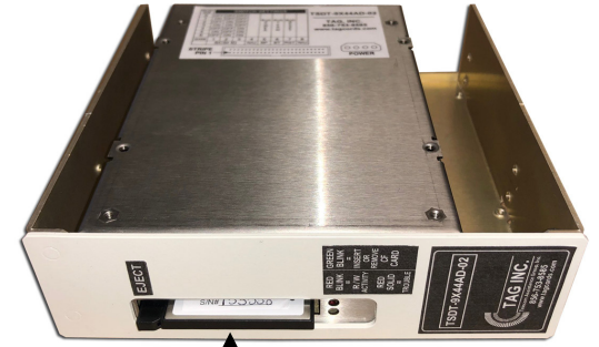
NEW TAPE DRIVE