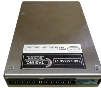
NEW HARD DRIVE