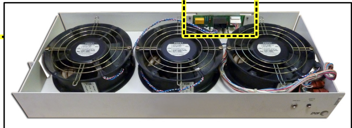
LUCENT 2B FAN TRAY w/ (3) EXISTING FANS (BOTTOM VIEW) (fan tray is not included)