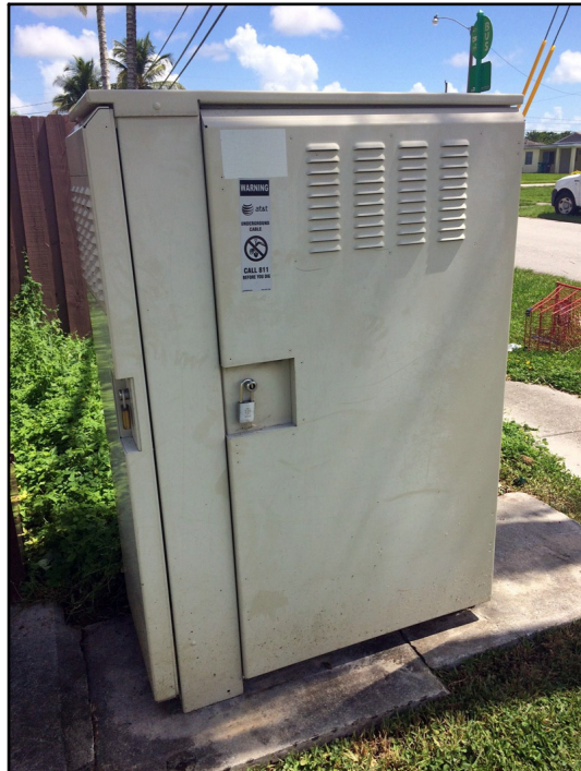
COMMSCOPE 52B CABINET (OUTSIDE VIEW)