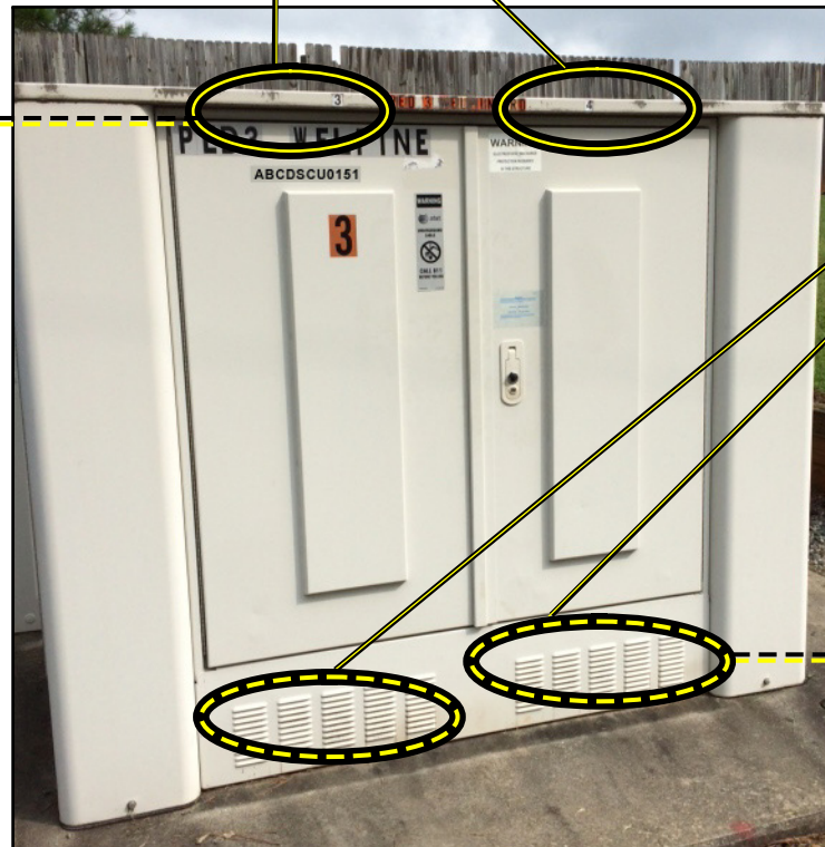
MESA 4 CABINET (OUTSIDE VIEW)

*(for Fan without Bracket, order # TF-MC225-02, Brightspeed SAP MAT # 1345223)