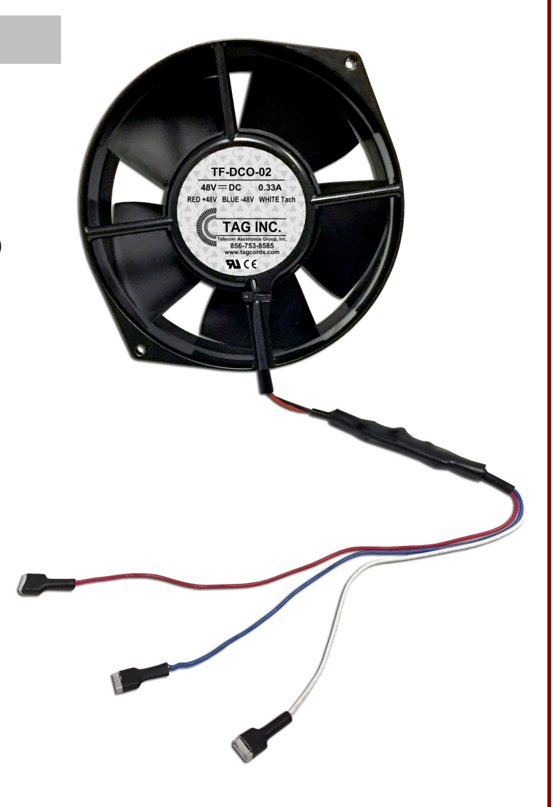
(Equiv. to ebm W2G130-AA05-20)