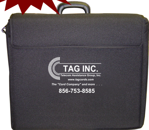
(1) 600209F Approx. Dimensions: Carrying Case 13" (H) x 20" (L)