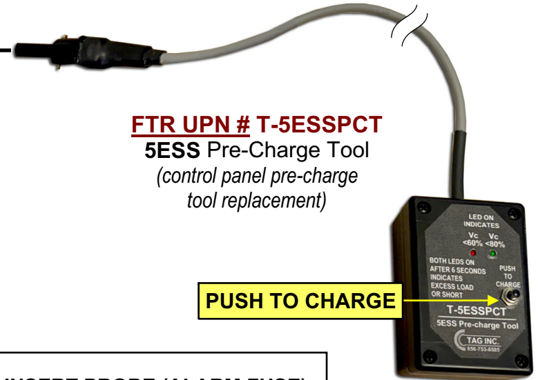
FTR UPN # T-5ESSPCT 5ESS Pre-Charge Tool (control panel pre-charge tool replacement)