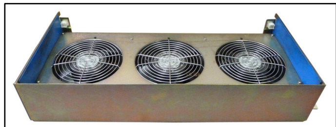
BLOWER ASSEMBLY # 3AL45446AA (w/ 3 EXISTING FANS) (blower assembly is not included)

150 Cooper Rd. (F-15) W. Berlin, NJ 08091