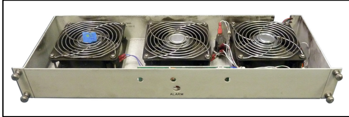
BLOWER ASSEMBLY # 695-3363-302 (w/ 3 EXISTING FANS) (blower assembly is not included)

(Square Fan) w/ Power Prongs (fan only - use with existing guard grill) (use in Blower Assembly # 695-3363-302)