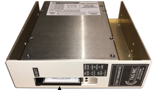
NEW TAPE DRIVE COMPACT FLASH TSD-CF-04 Industrial Grade Compact Flash Telecom Assistance Group, Inc. 4GB 856-753-8585 www.tagcords.com