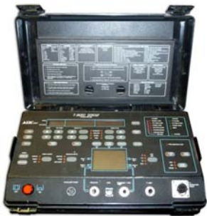
T-Berd 209 OSP Test Set (not included)