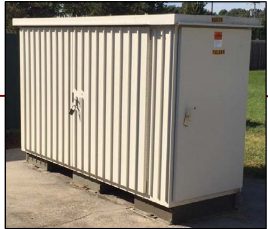
LS2000 CABINET (OUTSIDE VIEW)