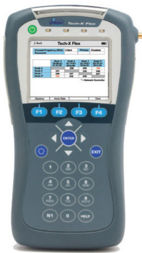
Spirent Tech-X-Flex** DSL Test Set (not included)