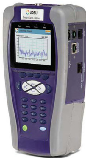
JDSU Smart Class* xDSL Test Set (not included)