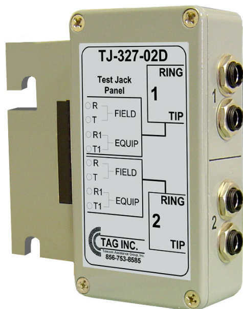
TJ-327-02D Test Jack Panel w/ (2) 327C Jacks