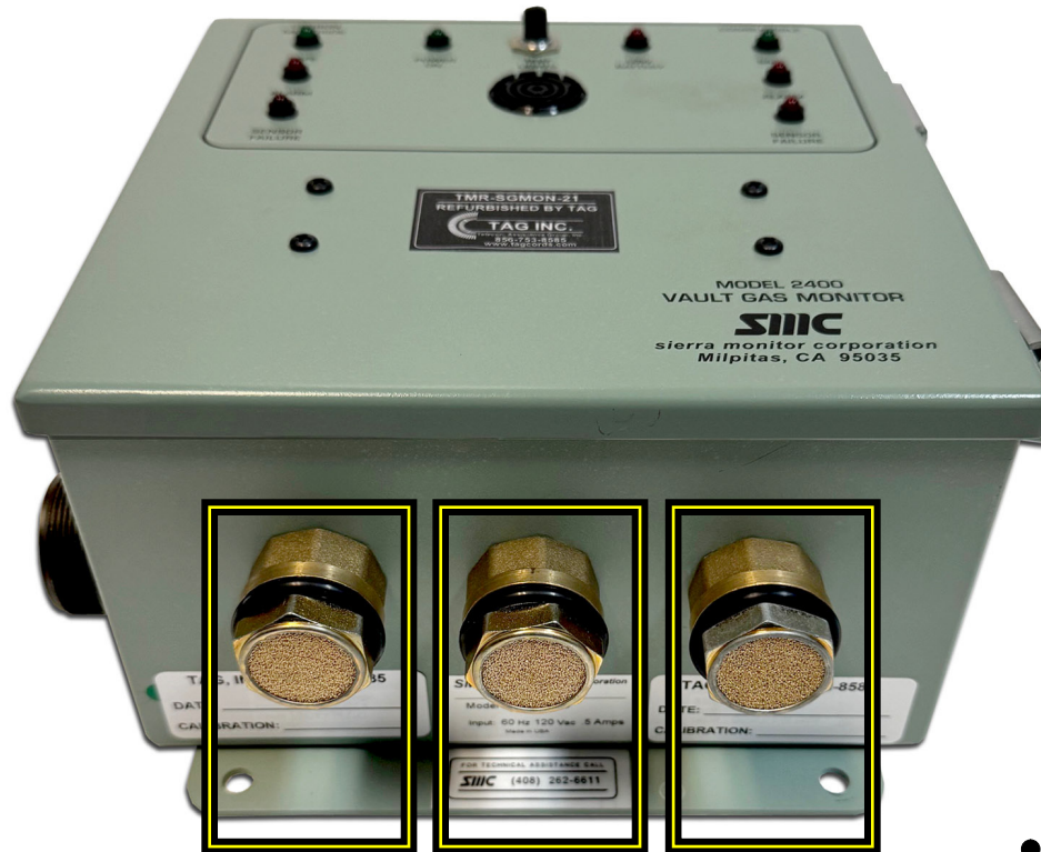
CARBON MONOXIDE SENSOR (CO - 25 PPM)