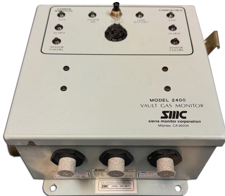
Sierra Vault Gas Monitor Model # 2400-01