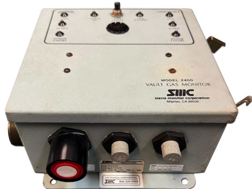
Sierra Vault Gas Monitor Model # 2400-21

150 Cooper Rd. (F-15) W. Berlin, NJ 08091