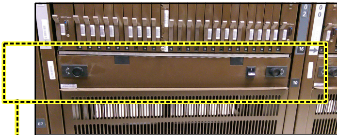
DMS-100 NTRX91AA FAN UNIT w/ EXISTING FANS