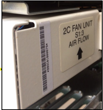
AIRFLOW DIRECTION POINTS UP (SIDE VIEW)