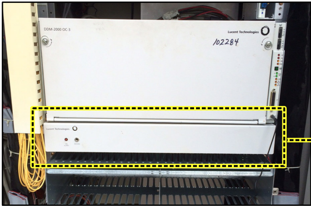
LUCENT 2C FAN TRAY IN MESA TYPE CABINET (fan tray is not included)