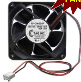
(5) # TF-DMS05P DMS 48VDC Fans w/ 2 Wire Plug