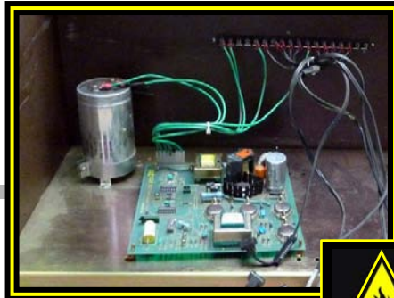
OLD 24VAC INVERTER

Convert your Existing 24VAC Fan Trays to 48VDC using the Tools Supplied in this Kit