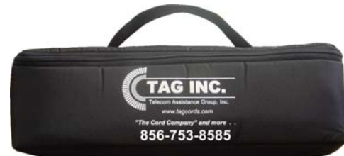
(1) 600209 Carrying Case Approx. Dimensions: 5" (H) x 16" (L)