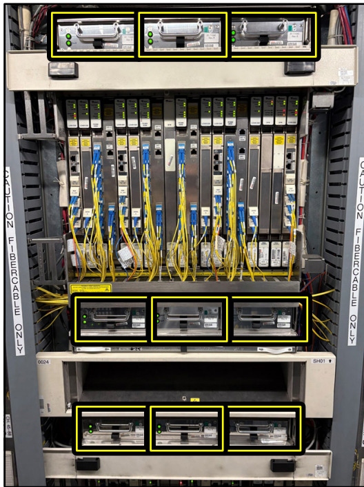
TELLABS 7100 BAY (9 UNITS PICTURED ABOVE, 12 TOTAL)