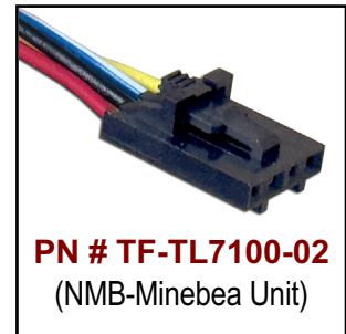
PN # TF-TL7100-02 (NMB-Minebea Unit)