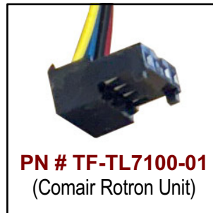
PN # TF-TL7100-01 (Comair Rotron Unit)