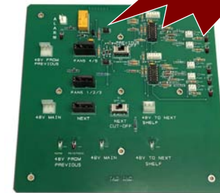
Fan Control Board w/ built in Sensors (no paddles needed)