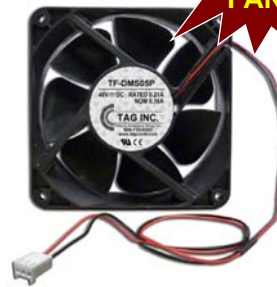
(5) # TF-DMS05P DMS 48VDC Fans w/ 2 Wire Plug