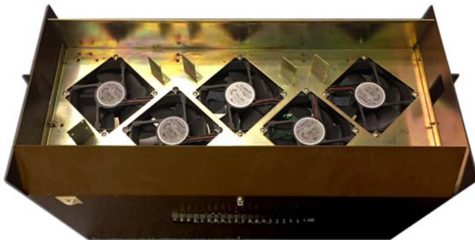
CONVERTED NORTEL DMS-100 NT3X90AA FAN UNIT * WITH (5) BRAND NEW 48VDC TAG FANS